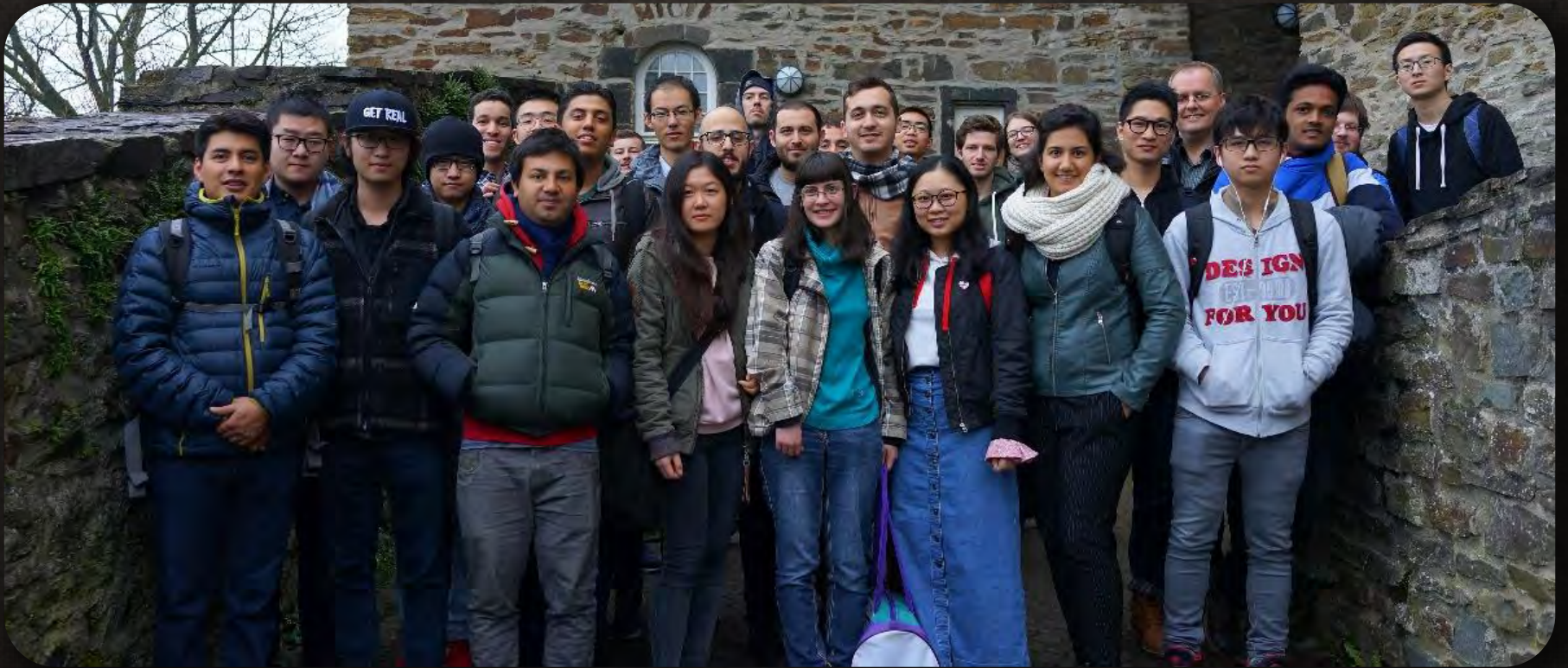
The group in front of the Castle Freusburg: One night in the Middle Ages...