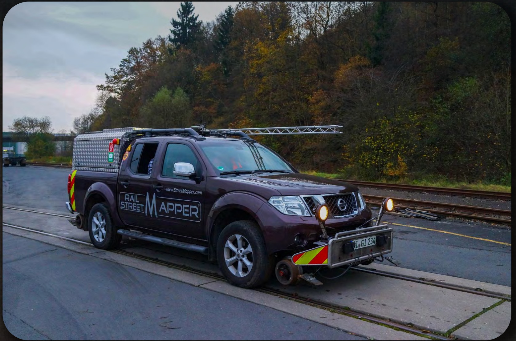
The IGI RailMapper in operation. From street to rail – changing between worlds?!