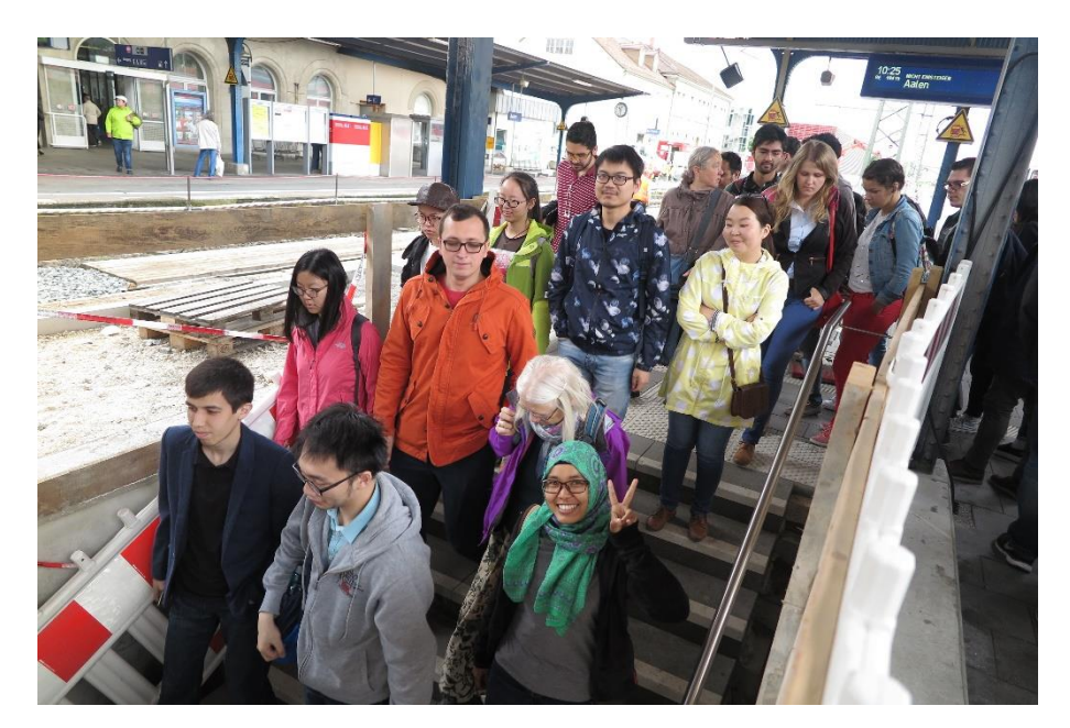
Figure 1. Arriving Aalen, in the train station

Many thanks to Institute for Photogrammetry and Dr.-Ing. Cramer for arranging this wonderful excursion for us!