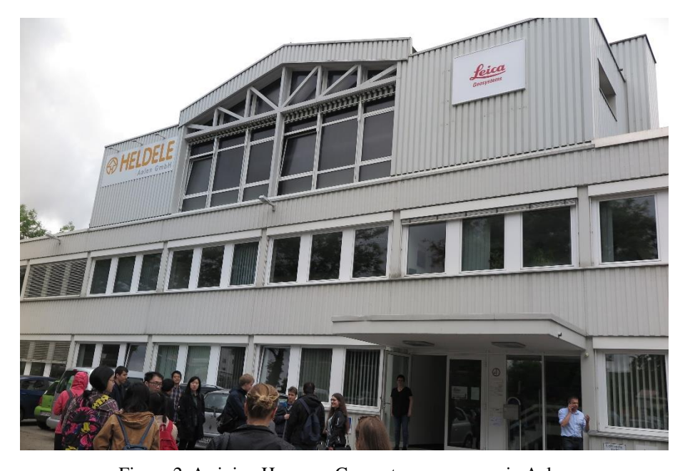
Figure 2. Arriving Hexagon Geosystems company in Aalen