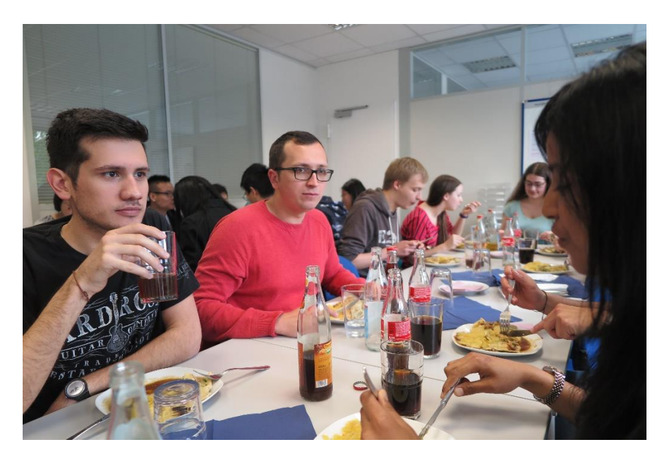
Figure 5. Delicious lunch "Maultaschen", in Hexagon Geosystems