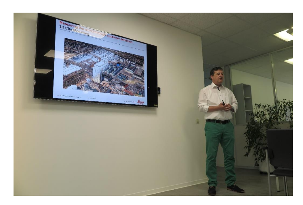
Figure 3. introduction about Hexagon Geosystems