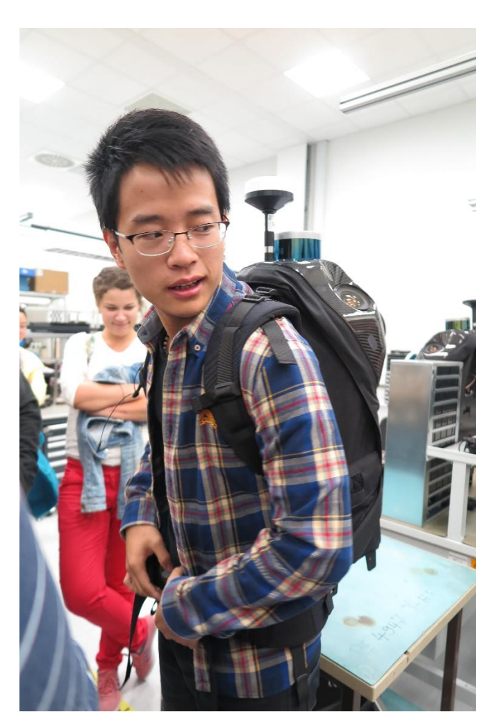
Figure 4. students trying out the Leica Pegasus: Backpack